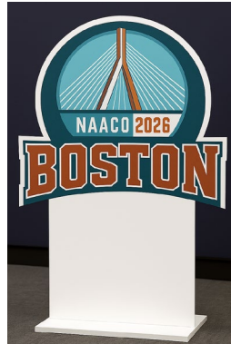
Sample Photo Prop (This does not reflect the actual photo prop)

Give attendees a professional glow-up while putting your brand front and center. Your logo will appear on the headshot lounge backdrop (virtual), and you'll have the chance to interact directly with attendees as they stop in for an updated profile photo – one they'll keep long after the event ends.