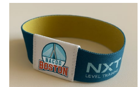
Sample co-branded wristband and notebook (These do not reflect the actual products)