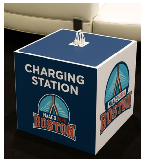
Sample Cube Charging Station (This does not reflect the actual charging station)

Keep attendees powered up – and connected to your brand. Located at the NAACO booth inside the Showcase. Choose between stylish branded charging cubes and/or sleek charging tables, each customized with your logo and design. Attendees will see your brand every time they plug in their phones or tablets, creating repeated, high-value impressions throughout the event.